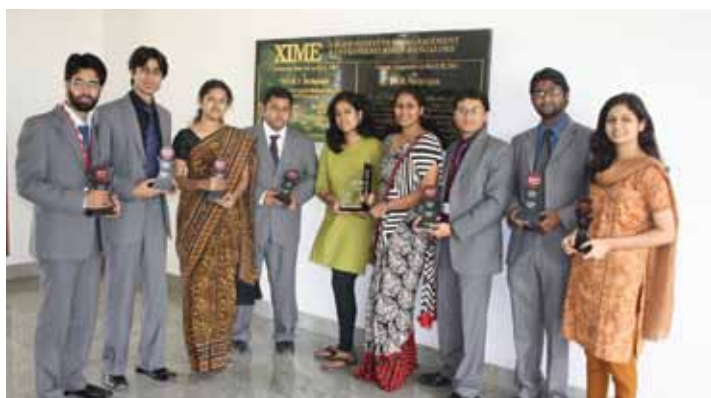
The winning XIME team at USHUS 2010