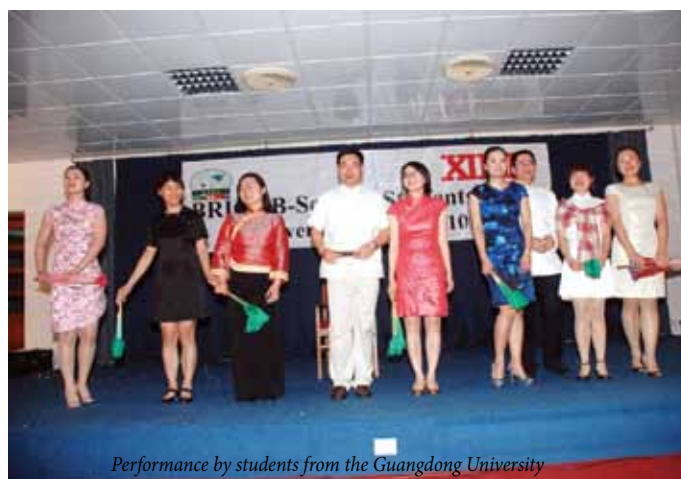
Performance by students from the Guangdong University