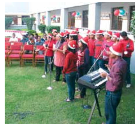
Christmas celebration at XIME