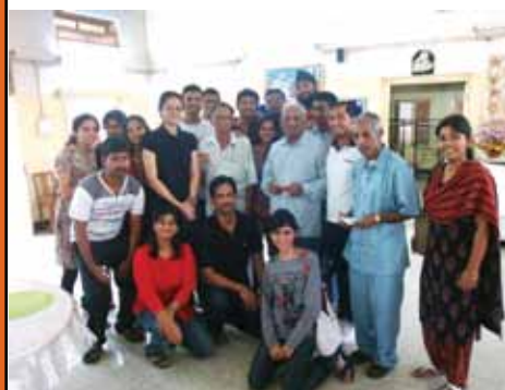
XSeed members at Little Sisters for the Poor

Members of XSeed, the social activity club of XIME, visited an old age home, 'Little Sisters of the Poor' in the early September.