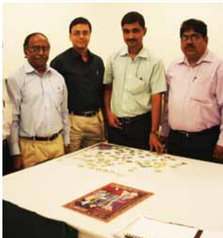
Participants of NDP in action

A group of seven participants from IG InfoTech India Private Ltd. took part in the Organization Based