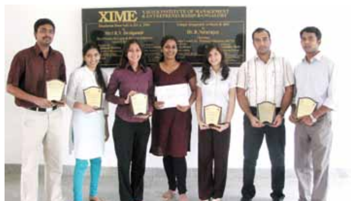
The winning XIME team at MMA Competitions