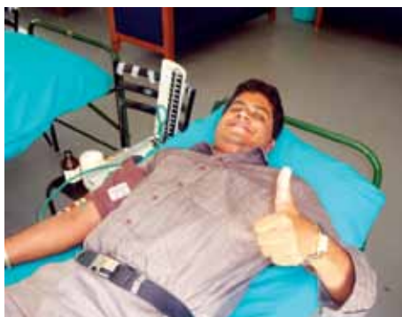
XIME student at the blood donation camp