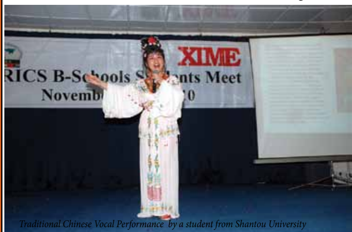
Traditional Chinese Vocal Performance by a student from Shantou University

The show was indeed a confluence of various cultures on one platform, reflecting the truly international nature of the ABBS.