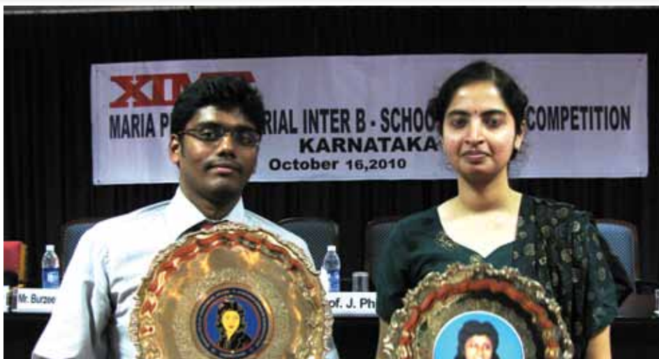
Winners from TAPMI with the Trophy