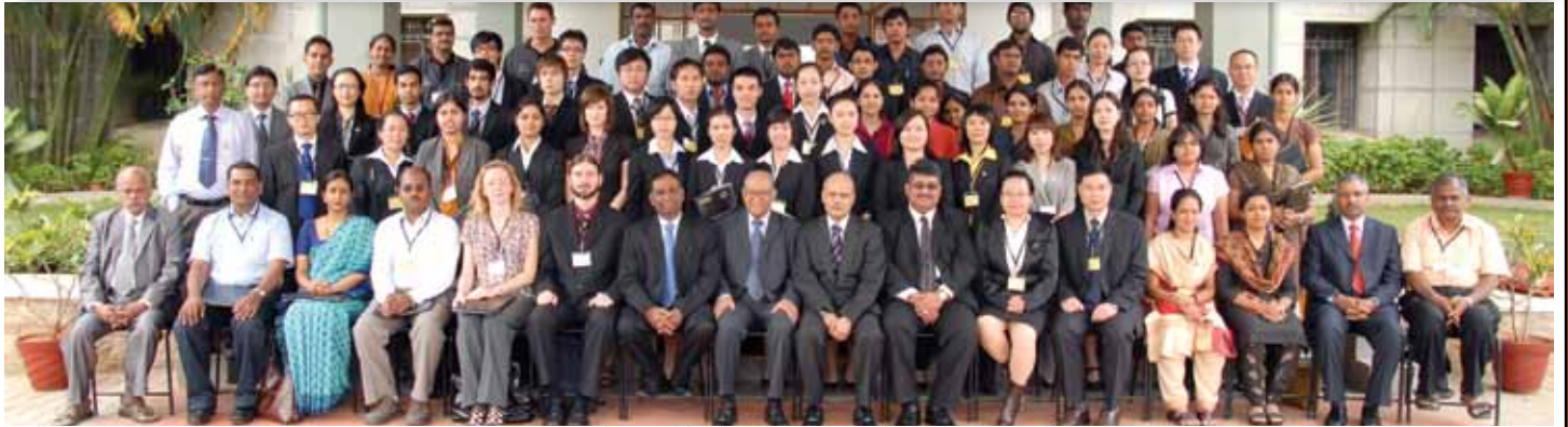
The students and faculty participating at the meet