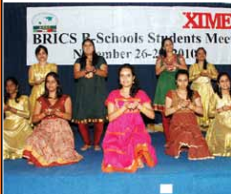
XIME students performing a contemporary Dance

The students of XIME showcased India's rich cultural diversity through a cultural extravaganza. Popular songs and dances such as Punjabi and Rajasthani folk enthralled the foreign guests.