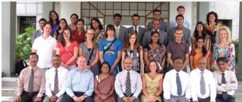
The Danish guests with faculty and students at XIME