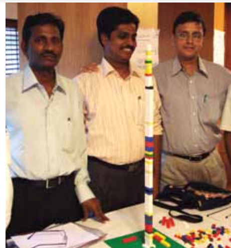
Participants of NDP in action